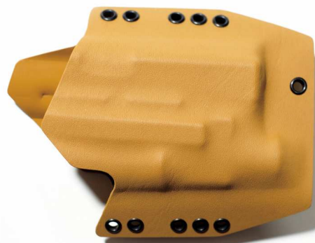
(Shown: KT DEFENDER™ Holster, Glock 19 w/ Streamlight TLR-3 Weapon Light, right hand, zero drop, coyote brown)

snail mail: KT MECH LLC 16433 N Midland Blvd #105 Nampa, ID 83687