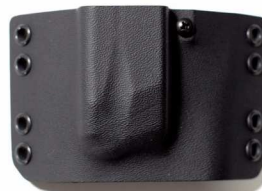
KT M1X Single MagPouch w/ adjustable retention (Shown: FNH FNP 45, .45 ACP, Left hand / bullet forward)

The KT MECH LLC supports our Local Law Enforcement personnel, both on and off duty, with our innovative product designs.