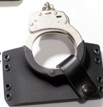
KT C-CLIP™ Non-linear handcuff carrier