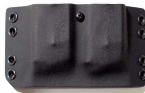
KT M2X Double MagPouch w/ adjustable retention (Shown: FNH FNX 40, .40 S&W, Left hand / bullet for- ward)

The KT MECH LLC supports our Local Law Enforcement personnel, both on and off duty, with our innovative product designs.